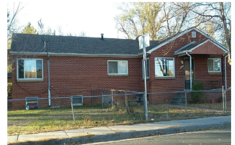
Duplex on corner of Wolff St. & 14 th Ave., recently purchased by the Kollel

The renovations for the temporary Bais Medrash are being done with an eye to the not-too-distant-future, ensuring that the space can be easily converted to a home for a family once the Kollel's new building is completed.