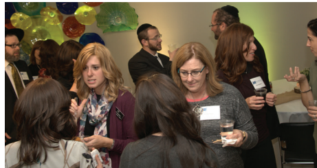
Partial view of the crowd at the event

"Tonight," he continued, "I am asking you to support the Kollel as they embark on their future with the new Kollel building and the new Bais Medrash