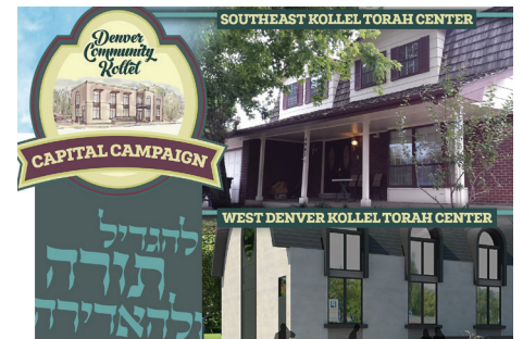
The two buildings the Kollel will be using for their Batei Medrash in two areas of Denver