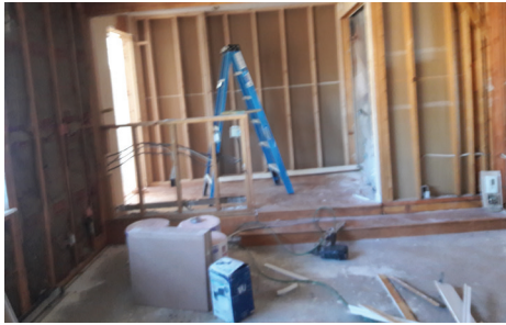
Scene from progress on the Kollel's new Southeast Torah Center